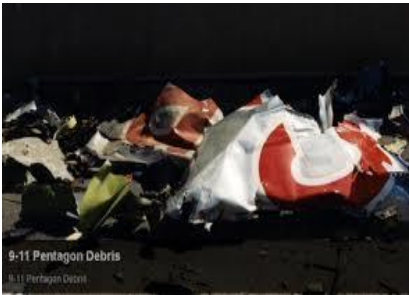
9-11 Pentagon Debris